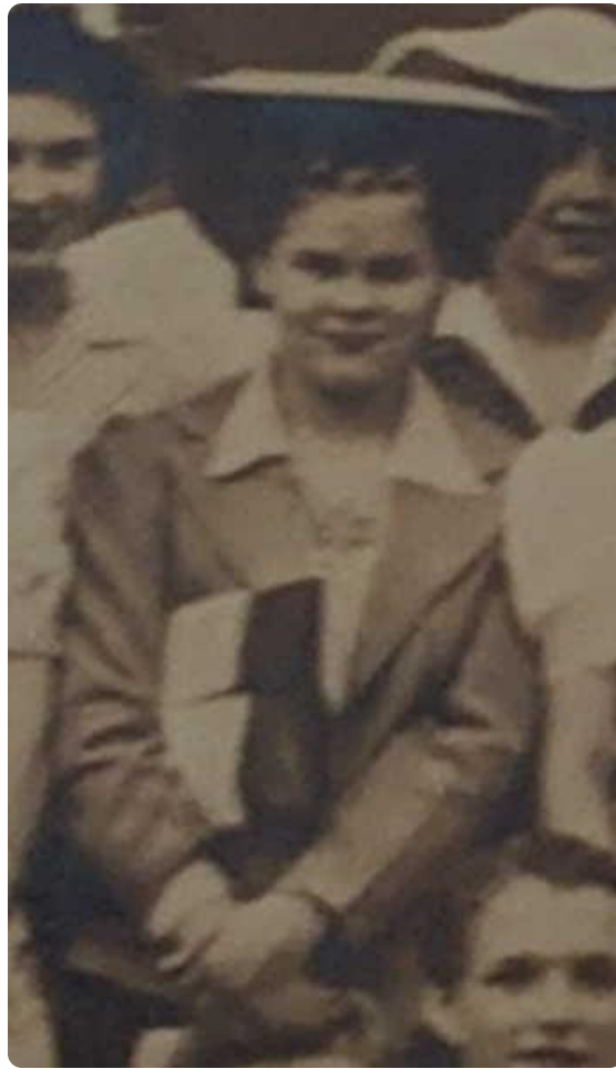
16 May 2019