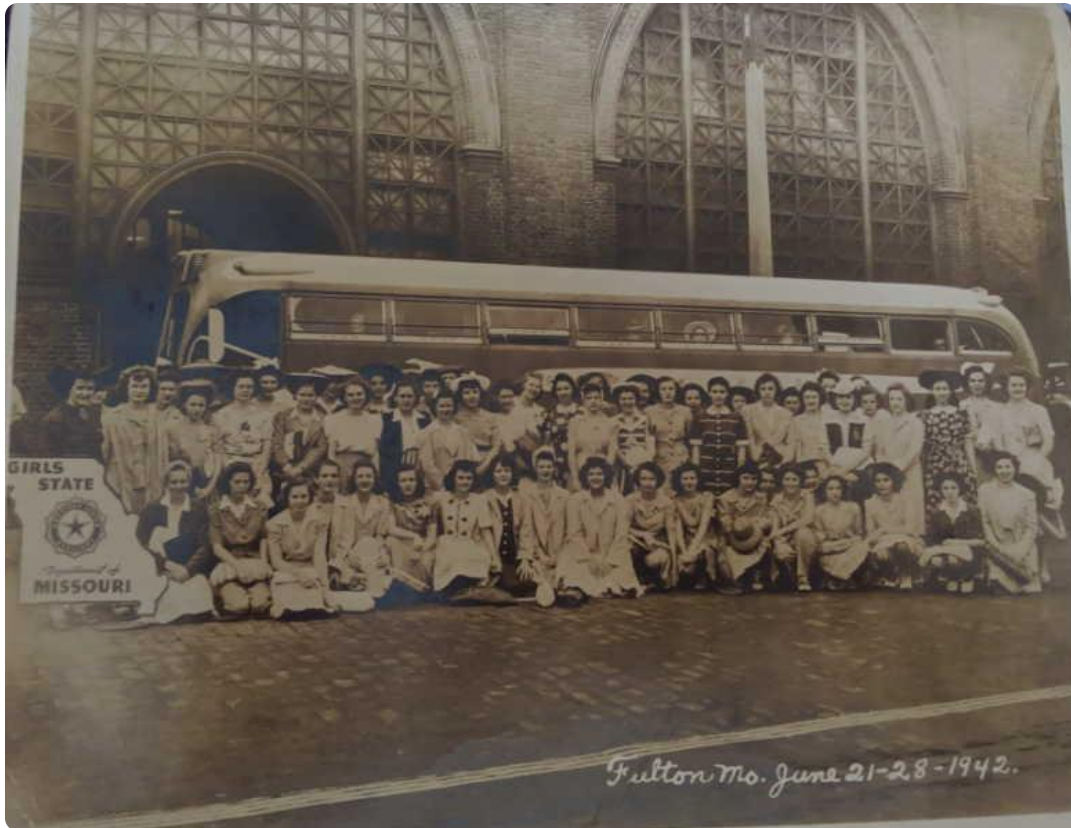
05 May 2019