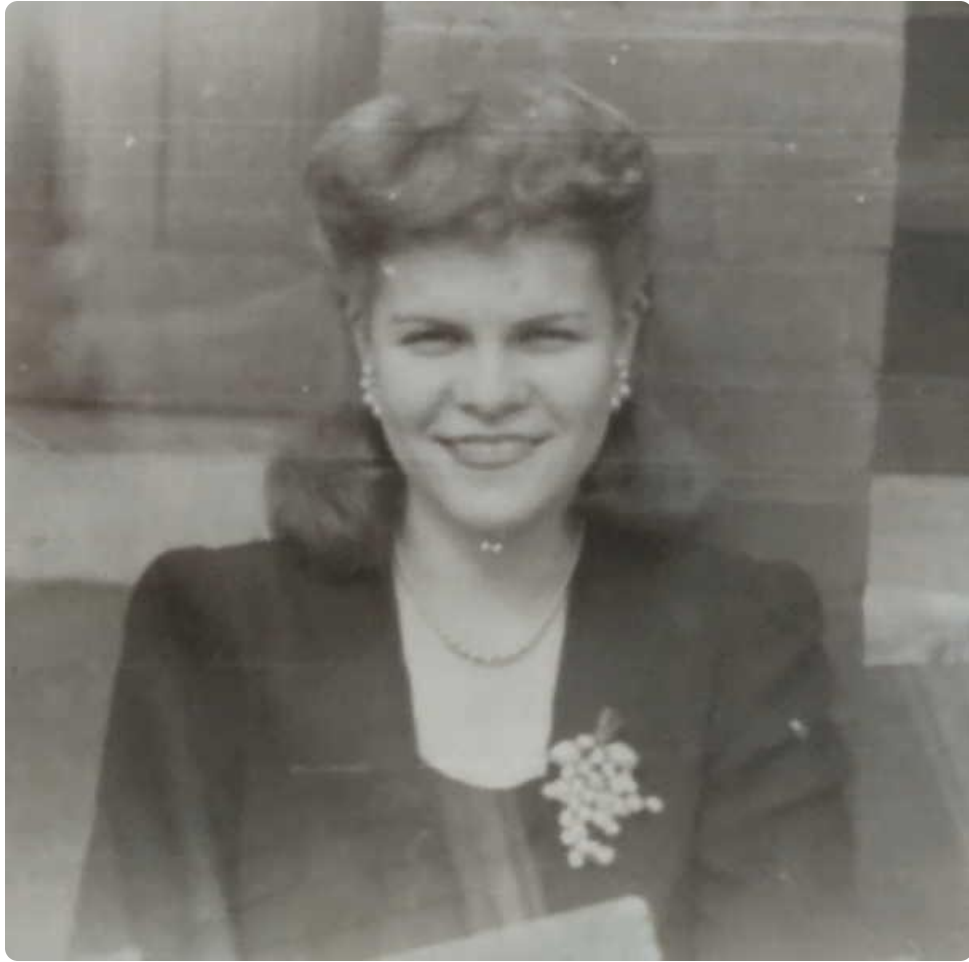
12 May 2019